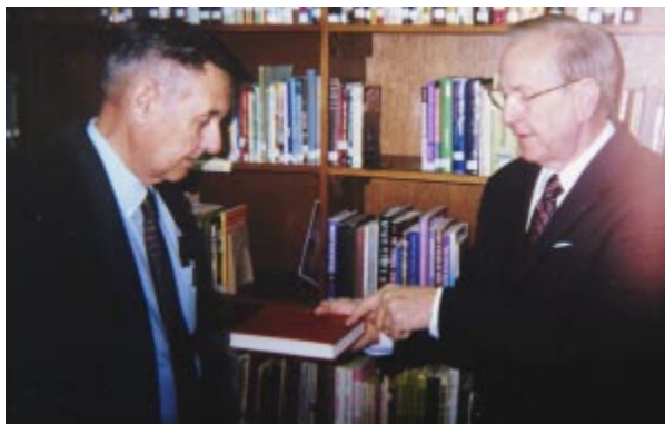
4. But He hates our sin.