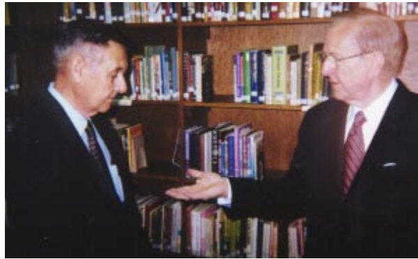
1. Let this hand represent you and me.

The "visual aid" gesture, pictured step-by-step below, has been found EXTREMELY VALUABLE in making the plan of salvation clear and understandable to the lost - especially on the point that the Lord Jesus Christ has made a complete payment for sin.