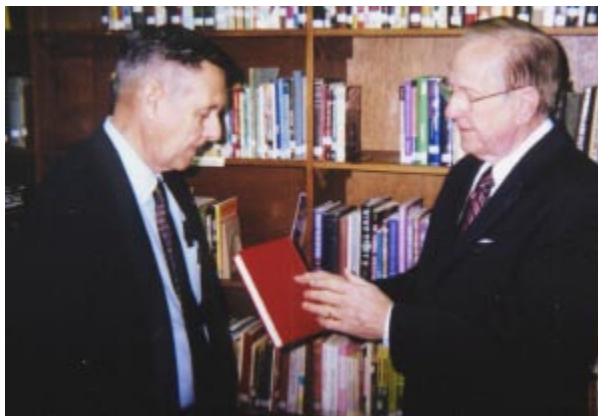
5. Our sin separates us from God. We cannot get rid of our sin by our good works. (Isa. 59:2; Eph. 2:8, 9)