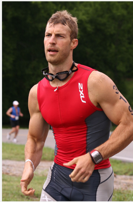
Dr. Josh Axe, Nashville Triathlon, TN

Seventeen years ago my mom was diagnosed with breast cancer. That was a crazy reality for my family at the time because she was a gym teacher, swim instructor and an active mom who looked healthy. How could someone so active end up with cancer at 40? I was thirteen years old and remember asking myself this question, but having no answer.