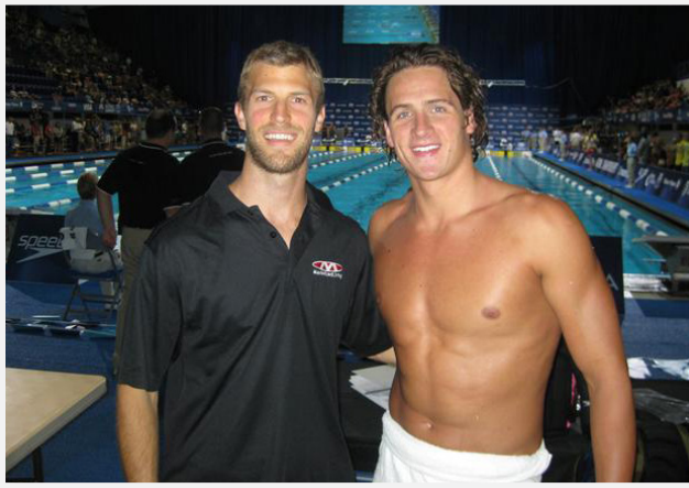
Dr. Axe, Ryan Lochte U.S. Swimming National Championships