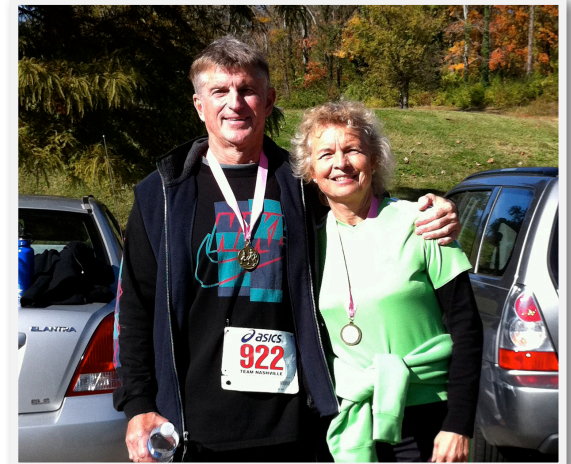
My mom and dad after she placed 2nd in her 5K

She actually just raced her first 5K last year and finished second in her age group at 58 years old! She went from Supersick to Superstar, by eating Superfoods. Can you see where superfoods could possibly help a loved one you know? Wouldn't it be of great value to them for you to share this information? Once you read this eBook, you can share these teachings and be a hero to someone else!